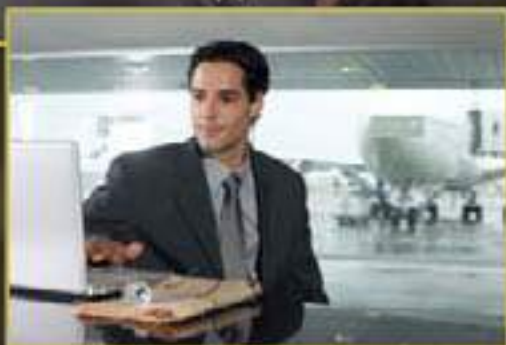
Success is a journey... not a destination