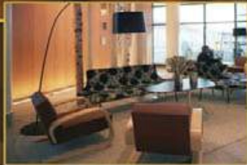
Private Meeting Lounges