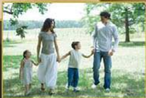
Central Green Park