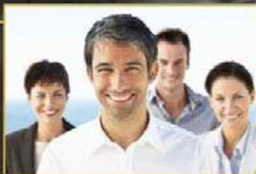
A Community of Achievers