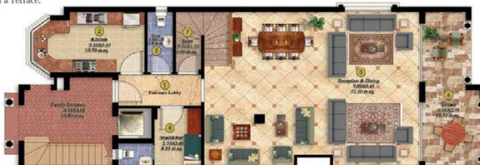
First Floor Plan Gross Area=151.00 Sq.M.