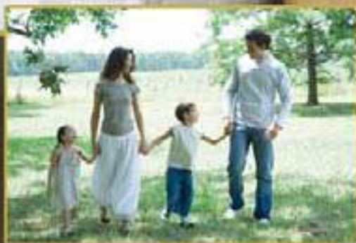
Central Green Park