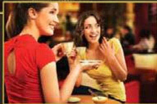
Café & Restaurant