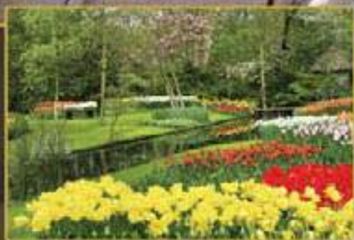
Power Supply Outlets Outdoors