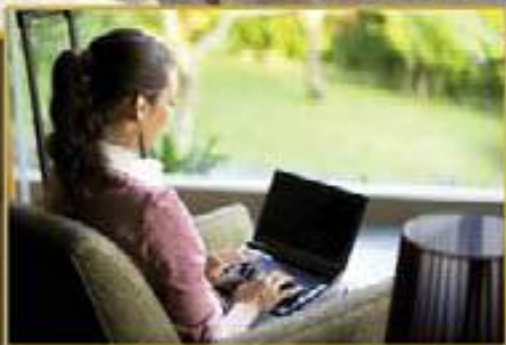
Stay Connected at all times