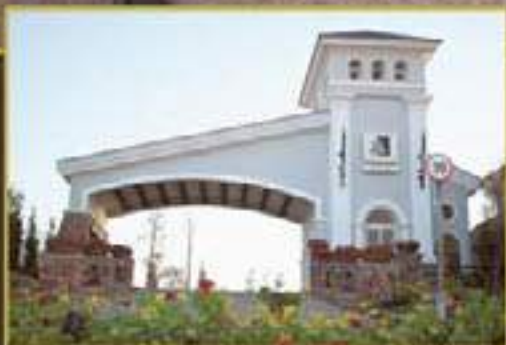
A Gated Community